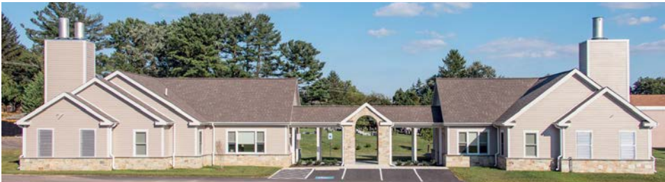
Dulaney Valley Cremation Center

Dulaney Valley Cremation Center offers families choosing cremation the peace of mind of knowing their loved one remains in our care from the cremation process to urn placement and optional inurnment in our memorial gardens.