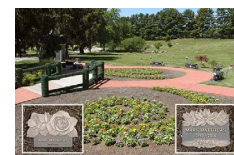
Tranquility Infinity Circle Niches