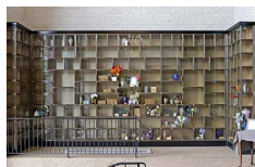
Mausoleum Chapel Glass Front Niches

The placement of cremated remains at Dulaney Valley ensures the permanent memorialization of a loved one with the exclusive benefit of perpetual care. Our inurnment options cater to most preferences, making the process more personalized and meaningful. While several options shown below are designated to specific areas, private options, including family columbaria, benches, pedestals, and boulders, may be placed in the garden of your choice.