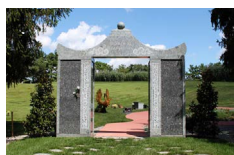
Tranquility Pagoda Niches