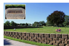
Apostles Circle Niches