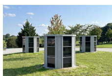
Harmony Hill Columbaria