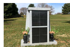
Private Family Columbarium