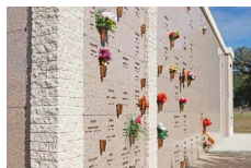
Mausoleum Cremation Niches