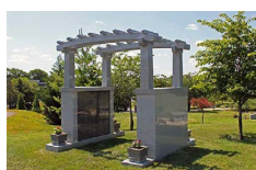
Harmony Hill Trellis Niches