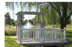
Serenity Lakeside Trellis Niches