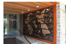
Angel Bronze Niches