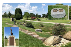
Butterfly Oasis Niches & Ossuary